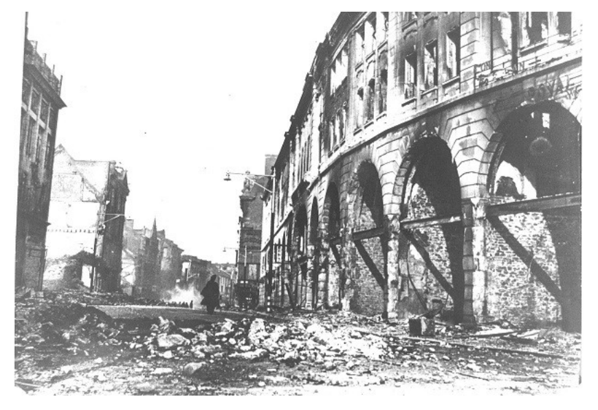
Castle street, looking North, after the Blitz

the café as being ' Razed to the snow '.